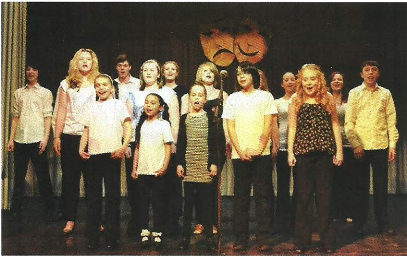
Music Theatre 2011 - Full Cast

The finale this year was a 'Thank You' medley of songs consisting of a 'Bricusse and Newley' and the famous Abba hit 'Thank you for the Music'.